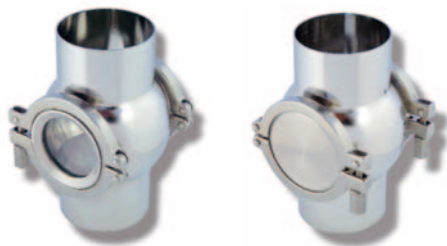
Inline housing with sight glass and blind flange