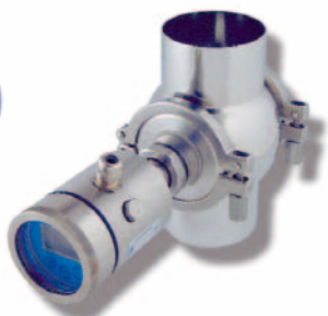
Inline housing with measuring sensor