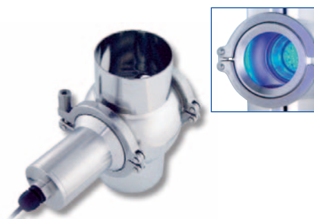
Inline housing with LED sight glass illumination

Finally, Kieselmann offers the following components: